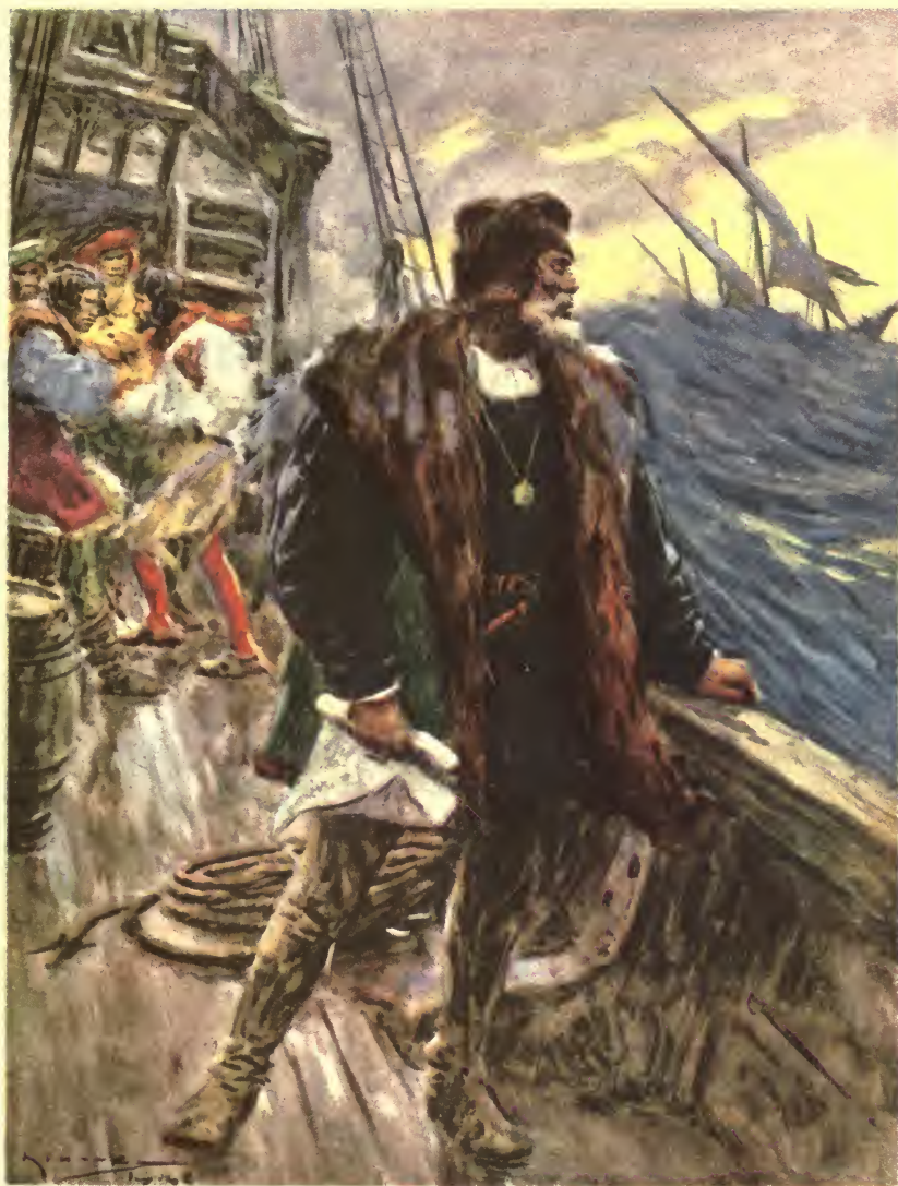
THE VOYAGE OF COLUMBUS

Again for days the ships sailed on, and as still no land appeared the men began to murmur.